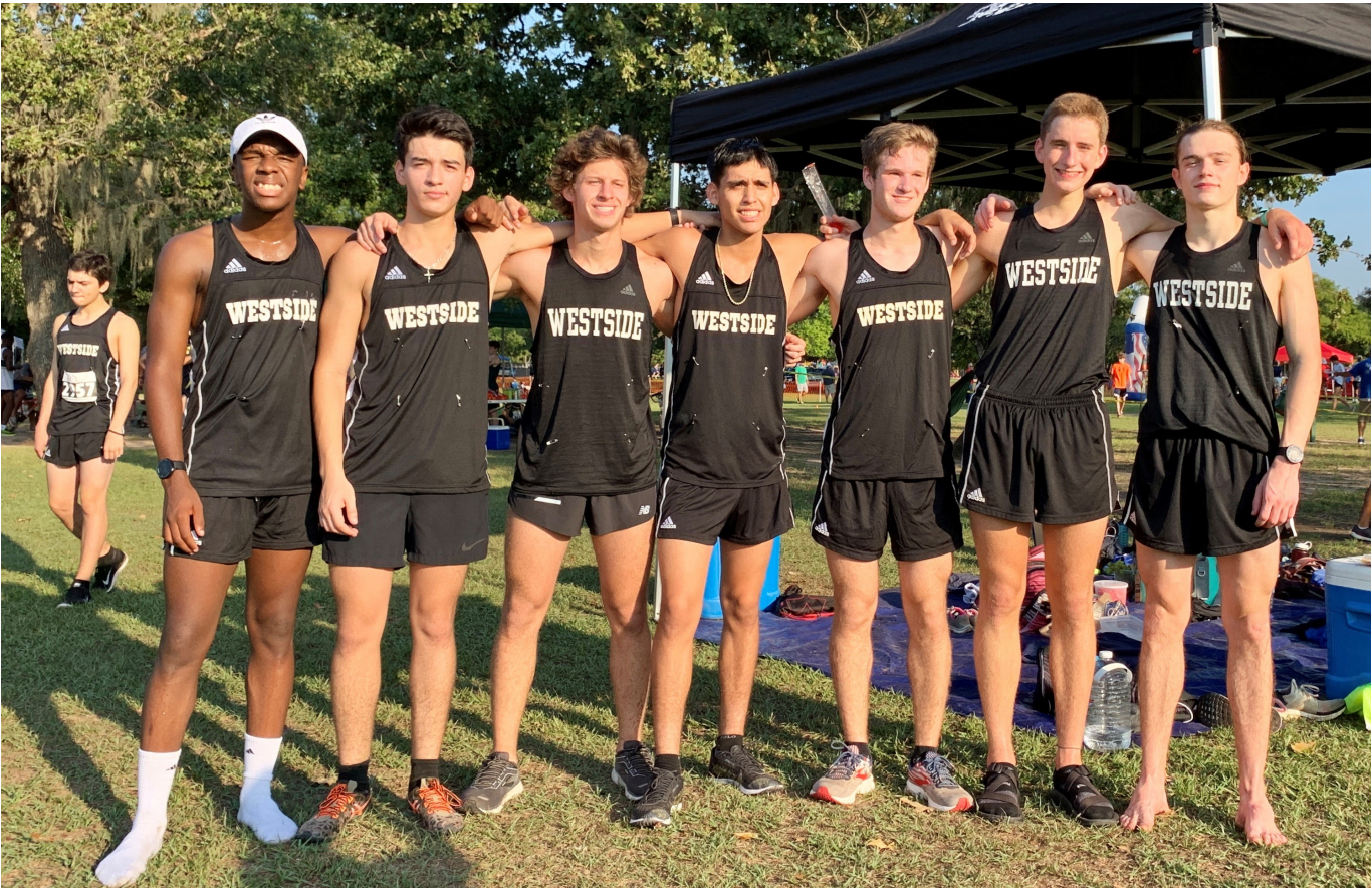
Boys Varsity Cross Country Team at Spring Branch Invitational last weekend.